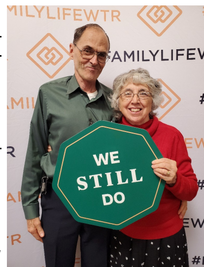
Figure 5 Weekend-to-Remember