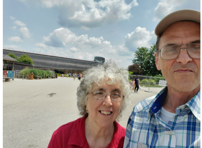
Figure 7 The ARK ENCOUNTER in Northwest KY