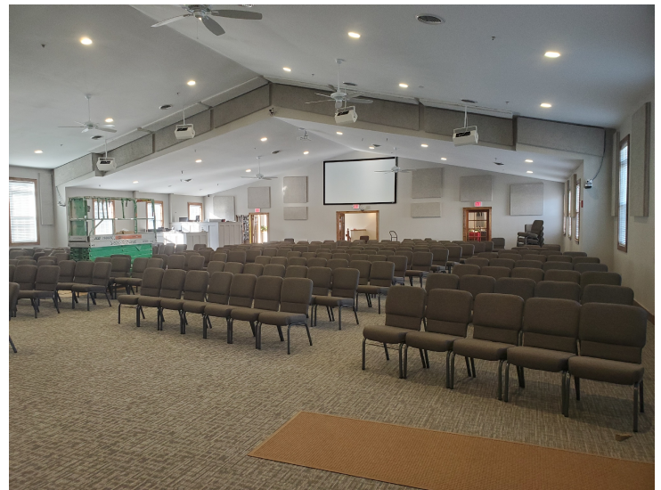
Figure 2 March 2021 TBC Expansion as Looking from Pulpit Right

Church blessings – 1) After 3 years of renovations, the TBC auditorium expansion