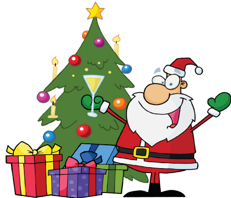
Figure 2 www.clipart-library.com