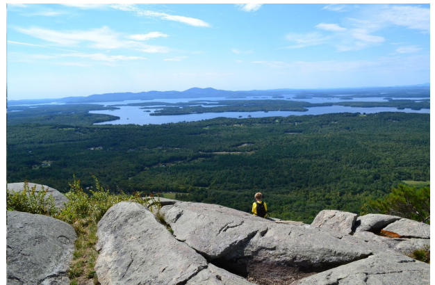
Bald Knob - A 5 mile NH hiking trail.

1 - Light Blue 2 - Tan 3 - Pink 4 - Green 5 - Orange 6 - Red 7 - Yellow