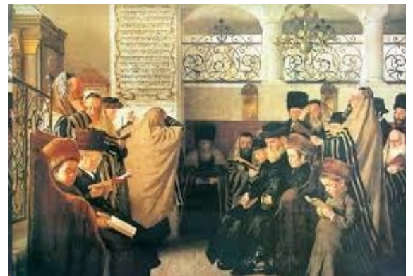
Figure 3 Yom Kippur- Day of Fasting