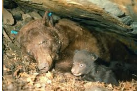
Figure 1 Hibernating Bear Family