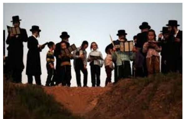
Figure 4 Family Celebrates Yom-Kippur