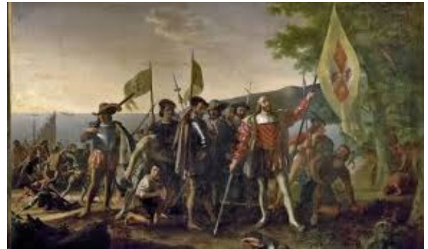
Figure 2 Columbus Day Painting