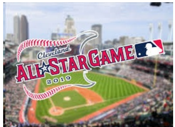
Figure 7 The 2019 All-Star Team, OH