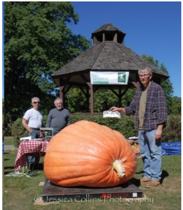
Figure 5 Milford 1000 lb Pumpkin

The post season of MLB playoffs begin. Finally, we will get a National League Champion, And an American League Champion, Then the World Series begins. Last year we had a Dodgers, Red Sox world series. This year we may have Dodgers, Yankee World series, We have had lots of them when the Dodgers were in Brooklyn, Now in Los Angeles. Reggie Jackson was known as Mr. October. First, we had the Philadelphia Athletics, Then we had the Kansas City Athletics, Now we have the Oakland Athletics. When Reggie was there, he won three World Series in a row. The record 5, the New York Yankees with Joe DiMaggio, Then Reggie joined the Yankees, he won more world series, Boston won the first World Series 5-3 over Pittsburgh I believe. They were known as the Boston Pilgrims then. Boston had two teams, the Red Sox and the Boston Braves, Who became the Milwaukee Braves, Now we have the Atlanta Braves. They will be in the playoffs this year. Quite often, Japan wins the Little League World Series. Last year we had a team of MLB all-stars, They traveled to Japan to play six games. Results: Japan won 5, the MLB all-stars 1. So, I ask you does America have the best baseball players?