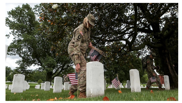
I am the Resurrection and the Life - John 11:25