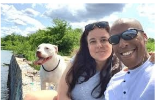
Pit Bull Support for PTSD veteran.