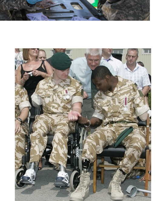
Three Limbs Left side soldier